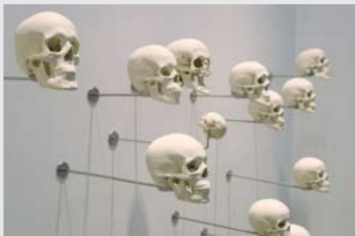
Gabriel de la Mora Memoria I , 24.10.07, 2007 [detail] calcium sulfate with cianoacrilate application, resin base and stainless steel supports [Visceral_Bodies-01]