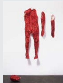
Kiki Smith, 1954 Untitled , 1991 ink on Gampi paper in four parts life size The Broad Art Foundation, Santa Monica [Visceral_Bodies-06]