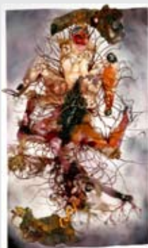
Wangechi Mutu I belong to you, you belong to me , 2007 Ink, paint, mixed media, plant material and plastic pearls on Mylar Collection Victoria and Warren Miro, London Copyright the Artist [Visceral_Bodies-04]