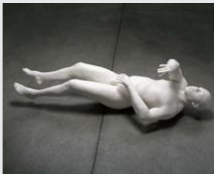
Marc Quinn Carl Whittaker - Amiodarone, Aspirin, Ciclosporin (Heart Transplant) , 2005 polymer wax and drugs © Marc Quinn [Visceral_Bodies-02]