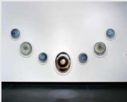
Helen Chadwick Nebula, 1996 colour cibachrome photographs mounted in perspex panels Collection of Joy of Giving Something Inc, New York [Visceral_Bodies-05]